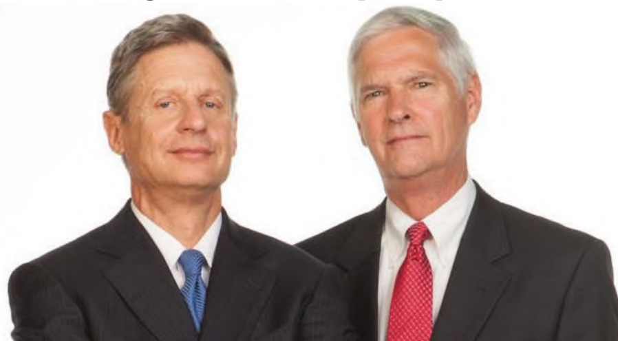
The Libertarian Party elected former two-term New Mexico Governor Gary Johnson (left) as its presidential candidate for the 2012 election. Judge Jim Gray (right), a veteran trial judge in California, was elected Vice President.

While left largely intact, some important changes were made to the party's bylaws and platform.