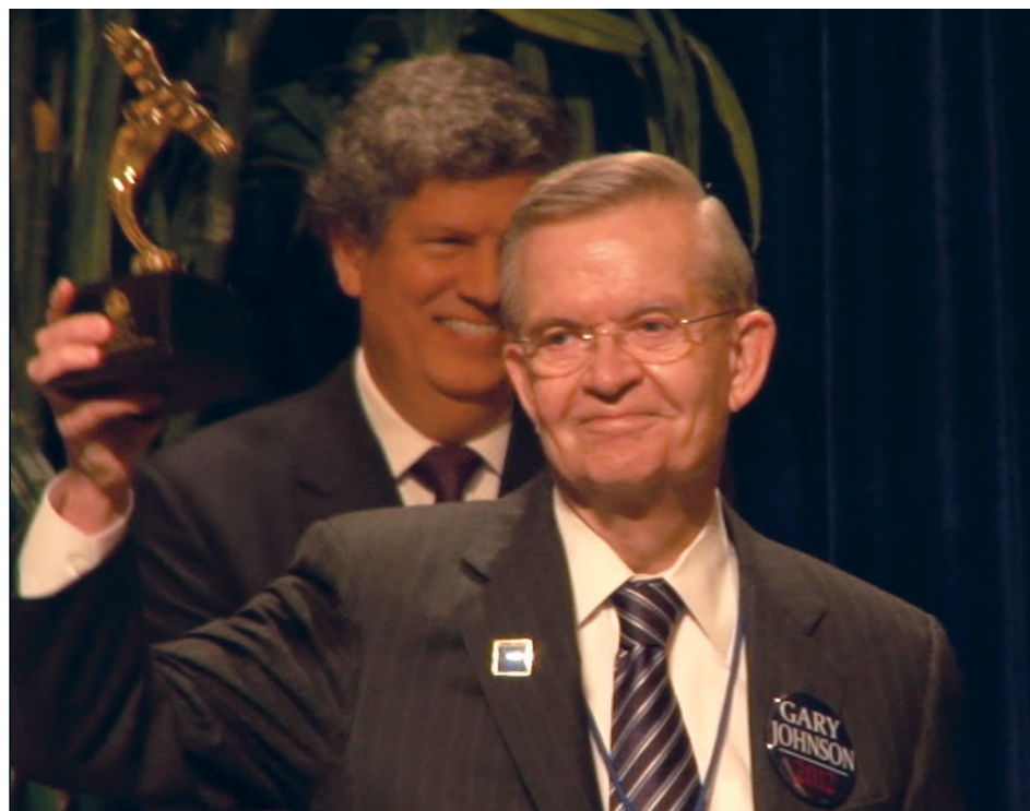
Ed Clark, the Libertarian Party's third presidential candidate (1980), accepts the "Hall of Liberty" award.

The THOMAS PAINE Communication Award was presented to the LP member who has been an outstanding com-