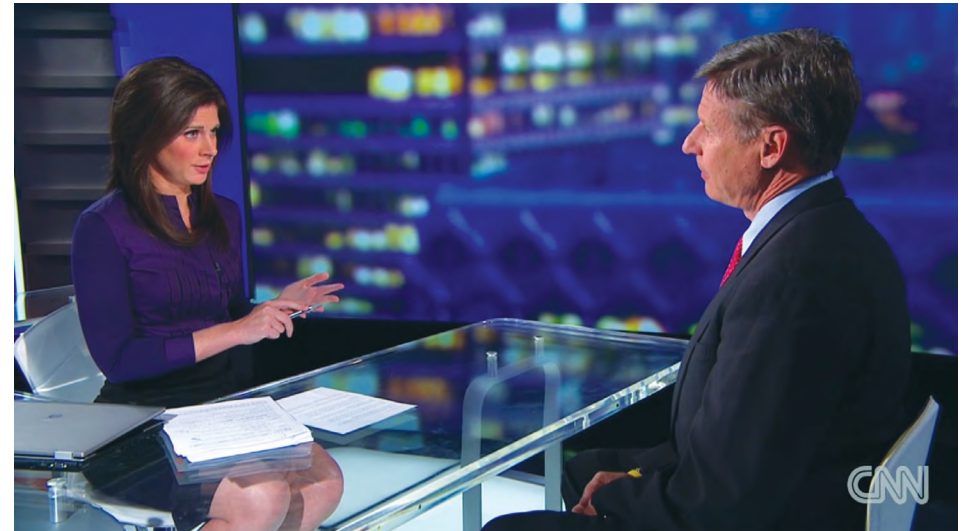
Libertarian Party Presidential Nominee Gary Johnson sits down with CNN's Erin Burnett to discuss his 2012 campaign to defeat Mitt Romney and Barack Obama.